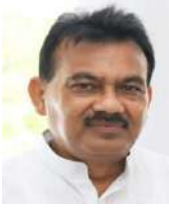
Shri Pranajit Singha Roy Hon'ble Minister, Tourism, Government of Tripura