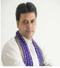
Shri Biplab Kumar Deb Hon'ble Chief Minister, Tripura